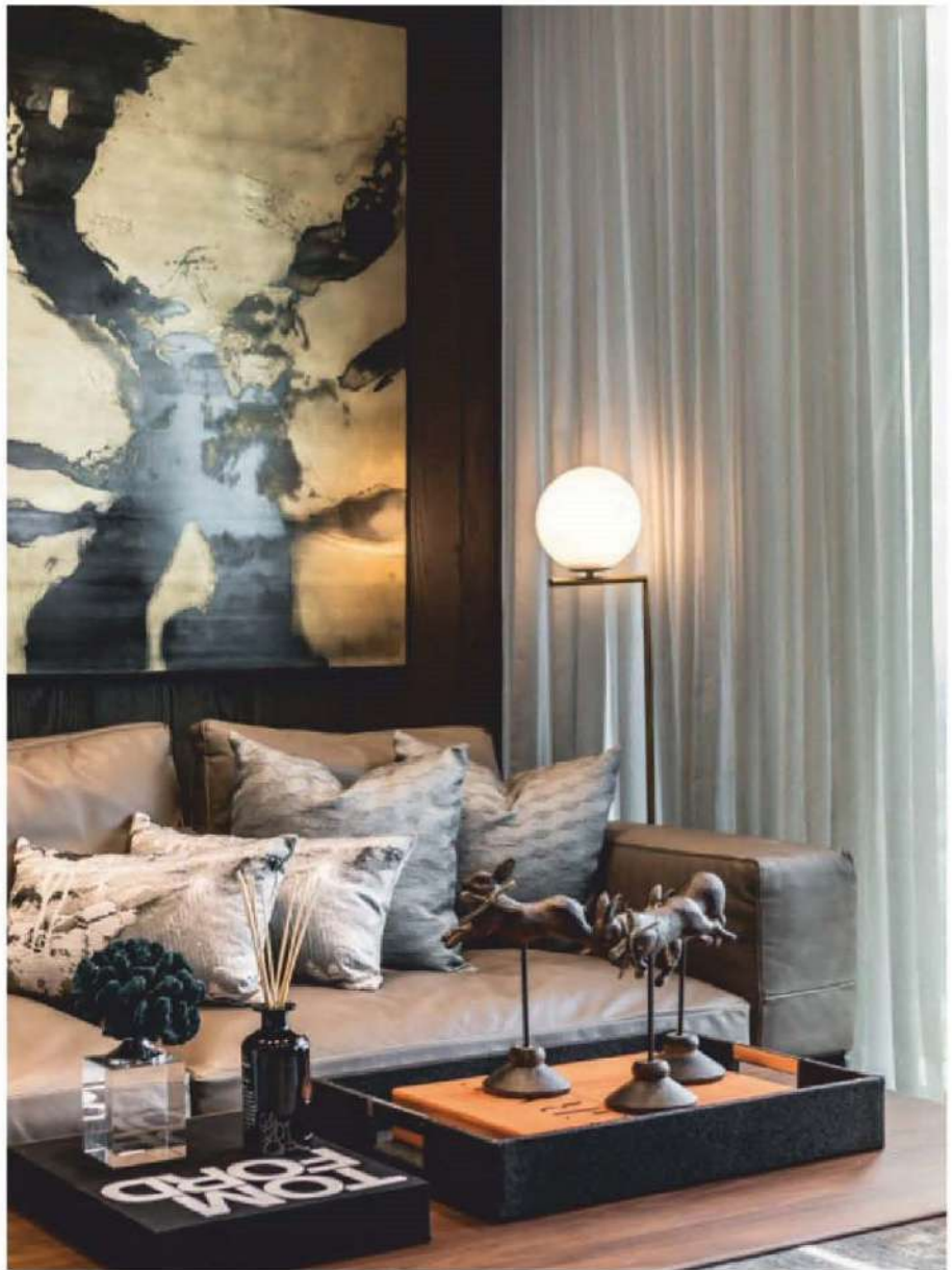
This page: The combination of dark wood and neutral tones create an understated look in this living room; an abstract artwork creates a focal point in a bedroom that features light wood cabinetry and flooring

In the past 15 years, the firm has steadily expanded its footprint abroad with a variety of projects in Switzerland and Israel as well as various cities in Asia. The team is currently in the process of designing resorts amid the Himalayan mountain range in Nepal, several new projects in Bhutan as well as a community library in Cambodia; the latter, in particular, is a project that Ng considers his greatest personal achievement.