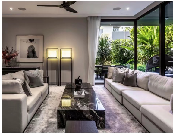
COVER Natural daylight pours into the living room through the large glass windows

See how Edmund Ng Architects designed a chic, monochromatic house with unique spaces perfect for hosting guests and a rooftop vegetable garden that the family carefully tends to