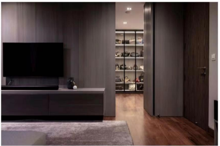
A peek of the walk-in wardrobe from the master bedroom

Don't miss: A Glamorous Apartment Inspired By The Ritz-Carlton Hotel Suites