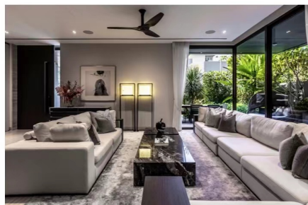
ABOVE Natural daylight pours into the living room through the large glass windows

In case you missed it: Kitchen Tour: Watch Architect Edmund Ng Cook Chili Crab and More in His Minimalist Home