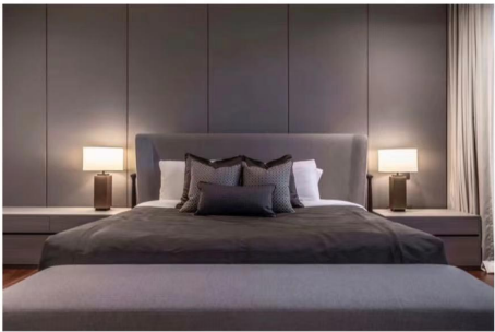
A dark colour palette lends a cosy atmosphere to the master bedroom

"The elegance and sophistication originated from the refined palette of details," explains Ng. "Every bespoke detail was carefully crafted and designed by making use of natural materials and textures. For example, we utilised Japanese rice paper wall covers and mixed them with natural oak veneer cladding before infusing them with an antique bronze finish."