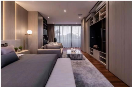
ABOVE This stunning room is a warm and inviting space clad in light wood

"As this is not just a show flat but an actual home to the owners, the pieces of furniture and the elements within the house had to have a connection with the owners and their lifestyle," he notes. "We really communicated with the owners throughout the project, going through the details and selections—especially for the customised pieces. This led to a house that has a great sense of the owners' individual characters."