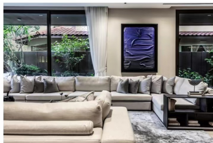
ABOVE The homeowners love for hosting guests is reflected in the living room's design