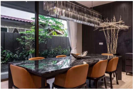
The dining room is furnished with a handsome mix of marble, leather and statement lighting pieces

Read more: Apartment Tour: An Artistic Penthouse at Marina One Residences