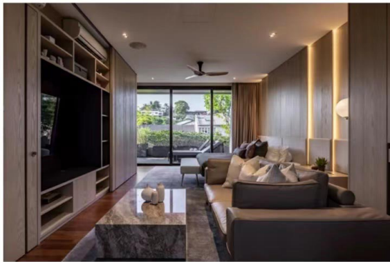
ABOVE The rooftop garden is accessible at the far end of the bedroom

The design team reconfigured two individual rooms in the attic and combined them into a large single room. This result is an expansive space with its own living area and home office. Dressed in light wood accents and furnished with light-coloured furniture pieces, the room has a noticeably lighter aura compared to the rest of the home.