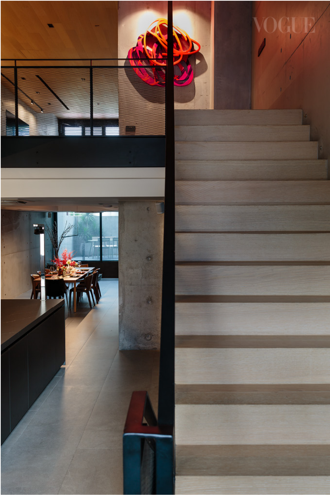
A striking artwork, ‘Seek & Deform’ by Erwin Windu Pranata from Ode to Art, is a focal point at the top of the staircase to the living room.