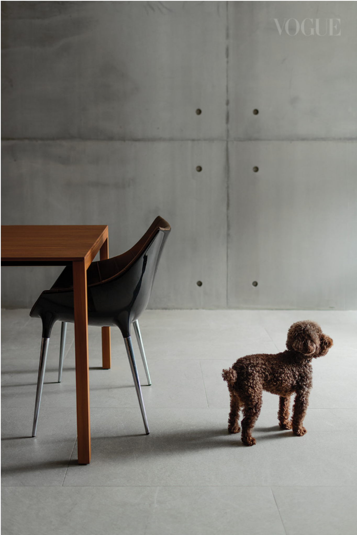
The raw concrete wall is a perfect foil for the minimal lines of the furniture such as the Naan dining table designed by Piero Lissoni and Passion dining chairs from Cassina designed by Philippe Starck. Clover, the pet dog, has ample space to run around.