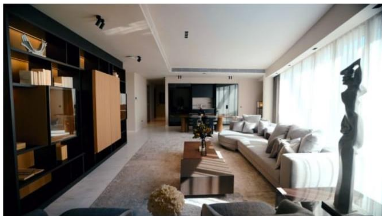
ABOVE The private living area on the 40th floor

At the other end of the art space is the stately dining room and kitchen. The super penthouse's expansive size allows the architect to incorporate large-scale bespoke statement design elements. One example is the four-metre-long stainless steel countertop, which, despite meticulous planning, could not fit into the lift and thus had to be carried by hand via the staircase up to the 39th floor—an arduous and labour-intensive task that required solid teamwork. “Despite these challenges, our team remained resilient and resourceful. We collaborated closely with skilled professionals, developed innovative solutions, and maintained clear communication throughout the process,” comments Ng.