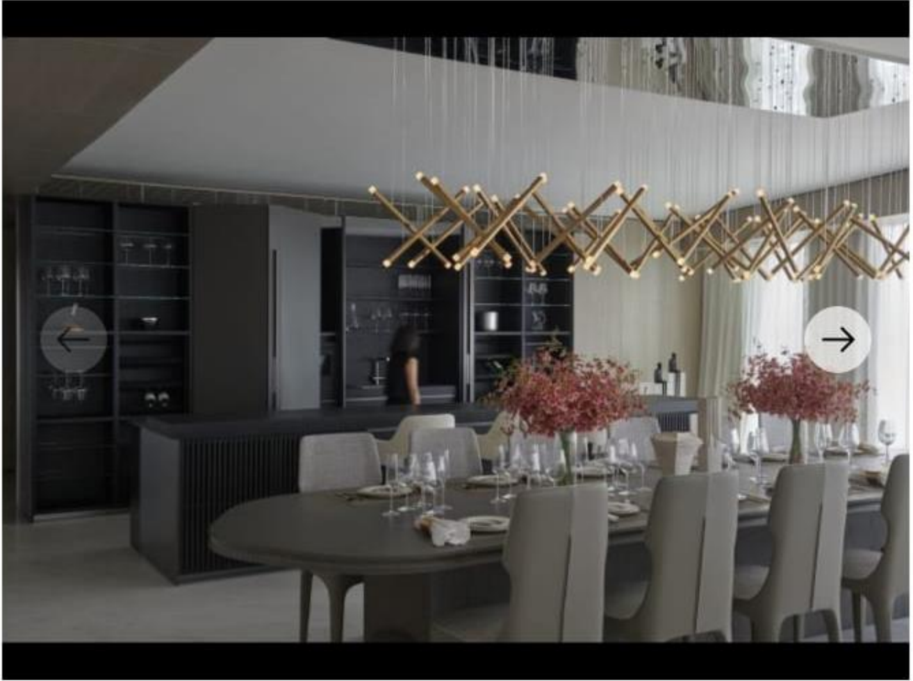
PHOTO 1 OF 2 The stately dining room