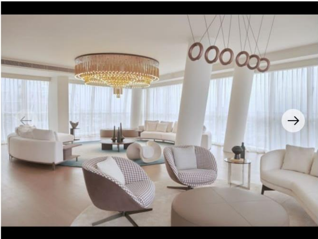
PHOTO 1 OF 2 The top floor of the penthouse is dedicated to the art of hosting and entertaining