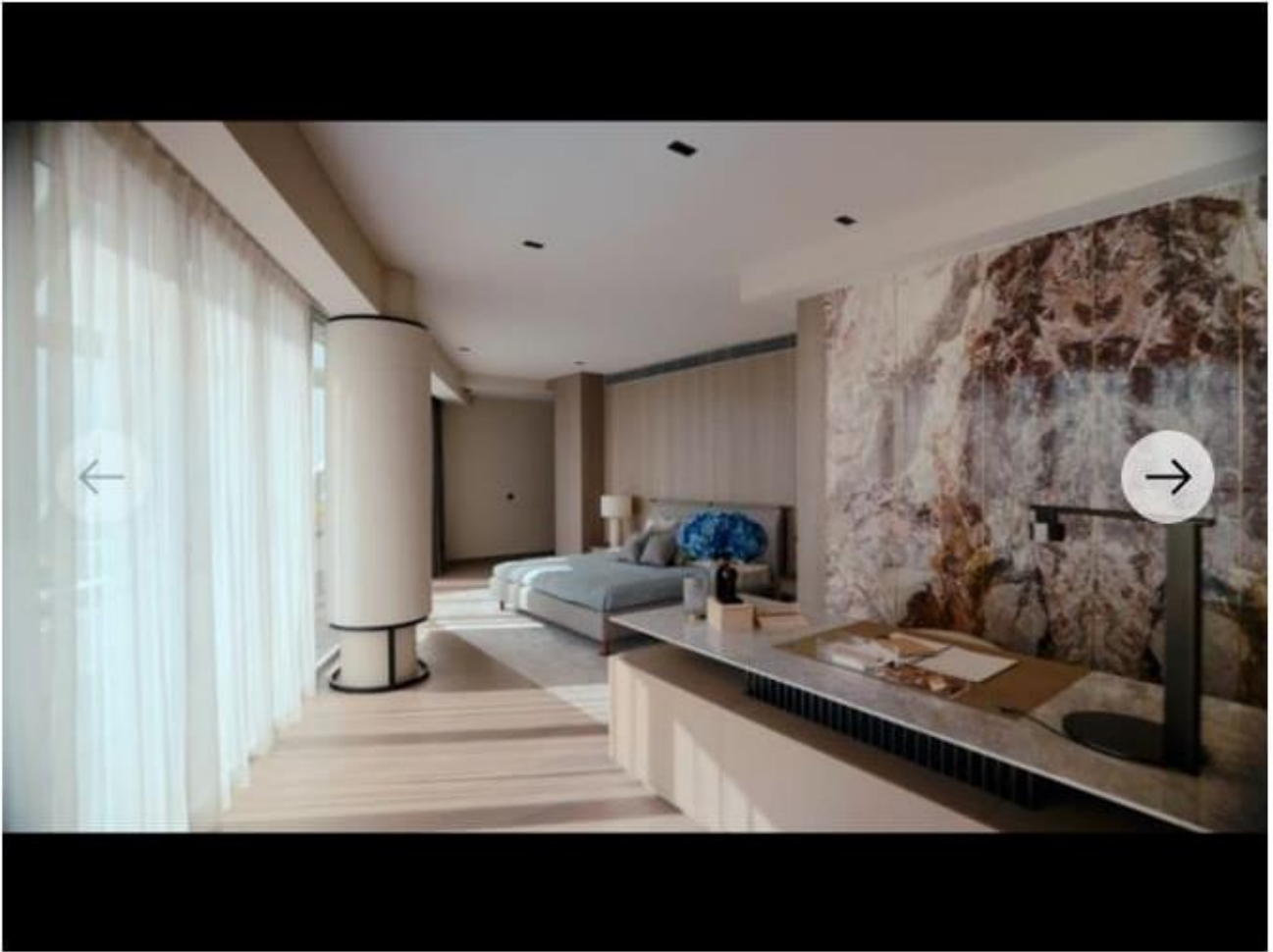
PHOTO 1 OF 2 The primary bedroom

The master suite features a show-stopping study with a backdrop of bookmatched marble slabs in rose gold and graphic burgundy veining. Another special marble is the Dover White marble used for the master bathroom's vanity top. Its creamy base and delicate grey veining lend a touch of sophistication to the room. A walk-in wardrobe outfitted with a Molteni&C system completes the opulent offering.